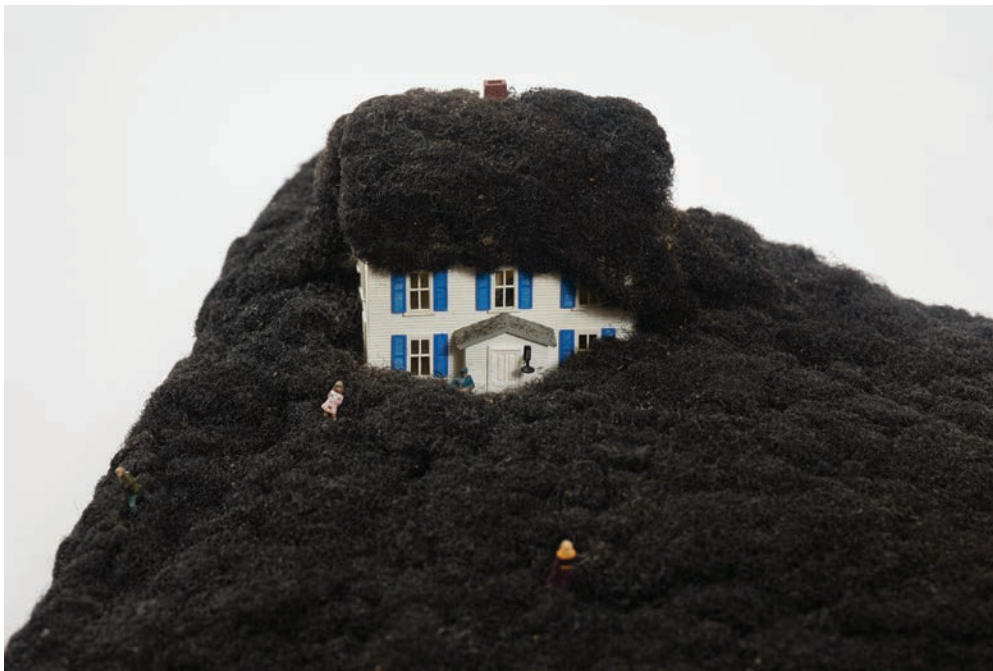
Jamal Cyrus. The End of My Beginning , 2005. Hair, toy house, and figures.

Thick mounds and rolling waves of bristly black hair blanket an otherwise genteel suburban setting in Jamal Cyrus’s 2005 maquette The End of My Beginning , immersing small trainset figurines and a two-story white clapboard house in an Afro-esque blizzard. Drawing inspiration from the humbly iconic work of artist David Hammons and his use of hair to encroach upon objects and their accompanying norms, from sofas to stones, Cyrus employs what he considers an eminently “black” material to suggest—and arguably announce—the arrival of a new dawn. With elemental might the dense, brambled hair in this Cyrus work envelops an idyllic island of upper middle-class life, forcing the residents to wade through an uncanny landscape thick with the mass, weight, and the undeniable presence of blackness.