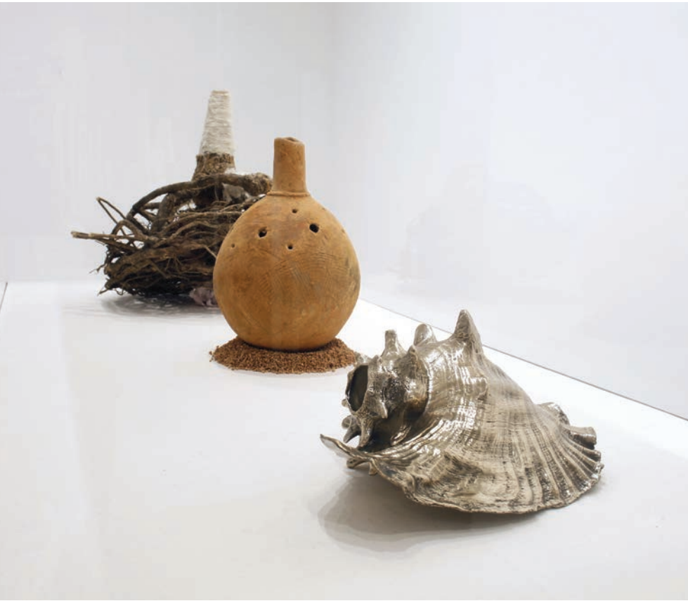
Jamal Cyrus. MSY , 2018. Root system, canvas, earthenware, and cast bronze. Collection of the Museum of Fine Arts, Houston.

Beyond its ecological incongruity, this tangled reading is amplified by the fact the Sargasso also carried many ships crisscrossing the Atlantic between the 16th and 19th century as part of the infamous Transatlantic slave trade. Between the “First Passage” of transporting African peoples and loading them onto ships, and the “Final Passage” between port and plantation, where these people were forced into enslavement, the “Middle Passage” involved epoch-shaping exchanges upon the waters between Africa, North America, and Europe. In the intense, often life-threatening state of “in-betweenness” for those being traded from Africa to America, in close quarters and the intentional intermingling of those from disperse communities (to break up existing tribes), captive Africans forged unlikely kinships and lasting exchange.