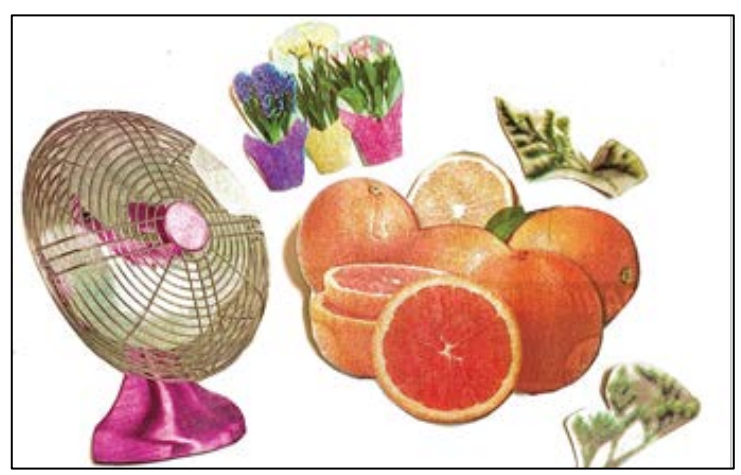
Steps 3-4: Arrange your cut outs so that all objects interact with one another in a purposeful manner. Once you've decided where you will like then placed, glue them down.