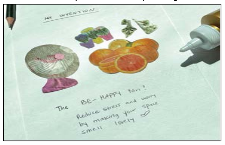
Step 5: Name your new hybrid product and write an entry about what it does!