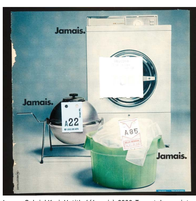
Image: Gabriel Kuri, Untitled (Jamais), 2006. Turn stubs on vintage magazine page, 10 % x 10 in. Courtesy of the artist and kurumanzutto. Mexico Citv