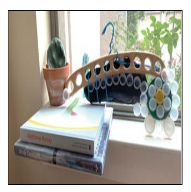
Step 4: Place your sculpture in a special location in your home, and enjoy!