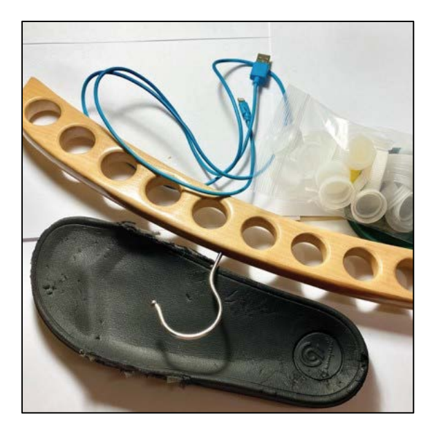
Step 2: Play around with the positions of the objects in relation to one another. Organize them in such a way that you have created a new hybrid object which incorporates all materials.