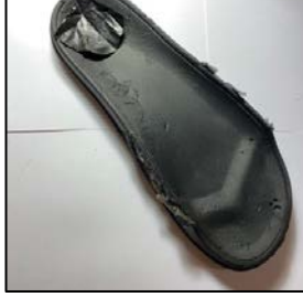
Step 1: Gather materials from your home to create your sculpture. (Pictured above scarf hanger, bottle caps, sandal.)