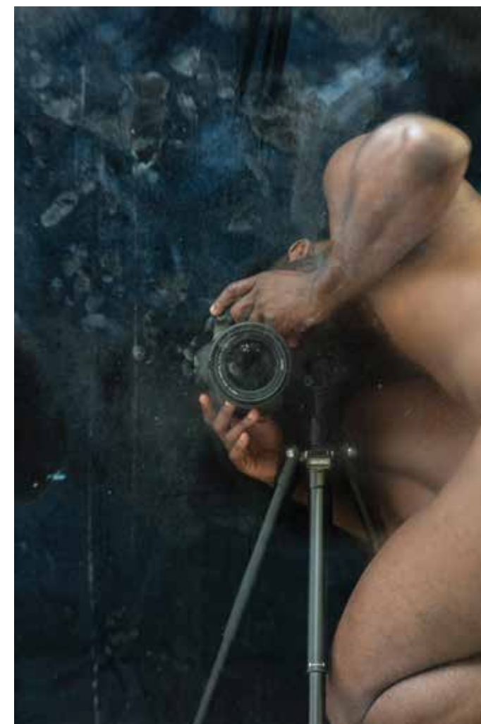
Paul Mpagi Sepuya, Darkroom Mirror Study (0X5A1531) , 2017. Archival pigment print, 34 x 51 inches. Courtesy the artist and team (gallery, inc.).

In combination with the drapery, Sepuya also uses mirrors as a surface to make visible the fingerprints and traces of touch that occurred before. As the artist states, “Nothing is hidden... There is the ‘dark room’ spaces, created within the drapes of the black and brown velvet...that space created is a world in its own, and only its darkness, or the black of the camera body and tripod, or my own body, can throw into view the latent traces on the mirror’s surface. We must allow ourselves to privilege darkness, and blackness, as requisites for vision.” Sepuya’s artistic practice is thus one of constructive desire: to photograph, to look, and to touch.