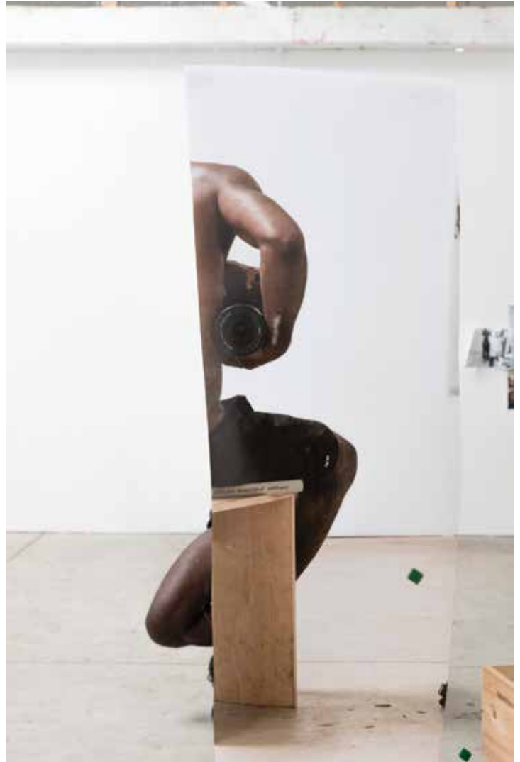
Image: Paul Mpagi Sepuya, Mirror Study (0X5A1317) , 2017. Archival pigment print, 51 x 34 inches.

Sepuya's current practice is largely grounded in the studio as a site through which people, objects, and experiences are translated into material that is positioned, related, and reworked. This work began as early photographs and self-made zines produced in his Brooklyn home and while participating in a series of formative artist residencies. Photographs often depict formal sittings or remnants of exchanges between the artist and others, creating a simultaneous presence and absence. Upon Sepuya's later move to Los Angeles, the studio became a more grounded site through which materials pass at a steady pace. This, in turn, also leads the artist's work to grow more complex and